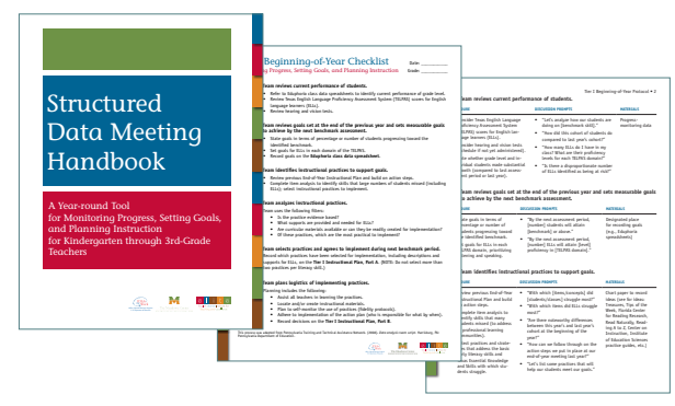
Figure 3. Sample pages from Project ELITE<sup>2</sup>'s Implementing Structured Data Meetings

consciously create and implement instructional plans that consider and align with students' instructional needs. For more information and additional educator resources, please visit https://www.elitetexas.org/resources-el/implementing-structured-datameetings-for-english-learners.